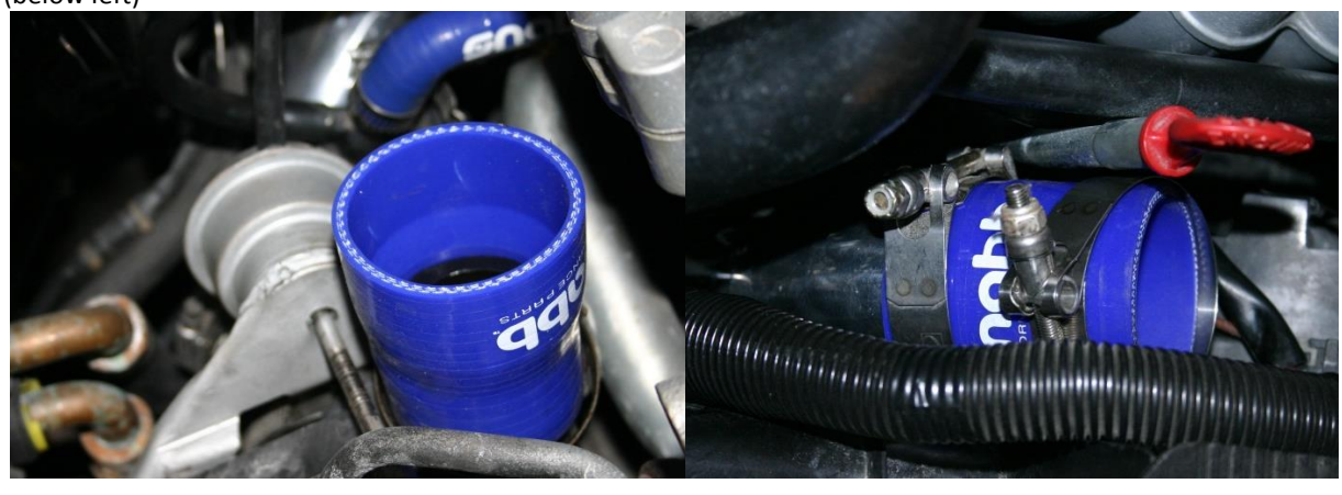
Install the 2.25" straight coupler to the top of the lower IC inlet pipe with a supplied 2.56" Tbolt, tighten all the way. (Above right)

Attach the 2"<2.25" silicone coupler to the turbo with the supplied 2.25" Tbolt. Tighten all the way. (below left)